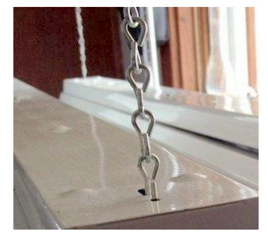
Chains & S-Hooks

Just buy the cheapest regular fluorescent bulbs you can find at the hardware store. It doesn't matter what brand. Then invest in one grow light bulb for each shelf. When plugged in the grow light bulb emits a more purple light.